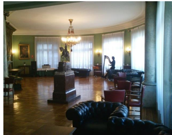
Salón Primo de Rivera