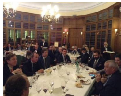
Lunch at the "Library" hall